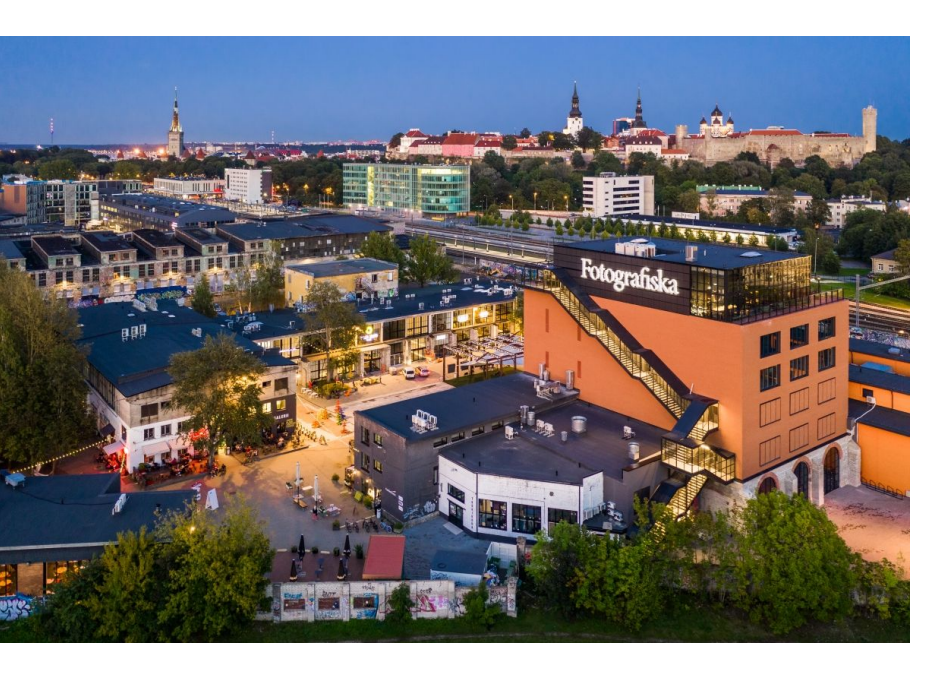
Telliskivi Creative City, Tallinn