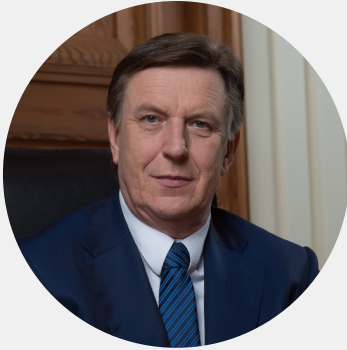
Māris Kučinskis Prime Minister of Latvia